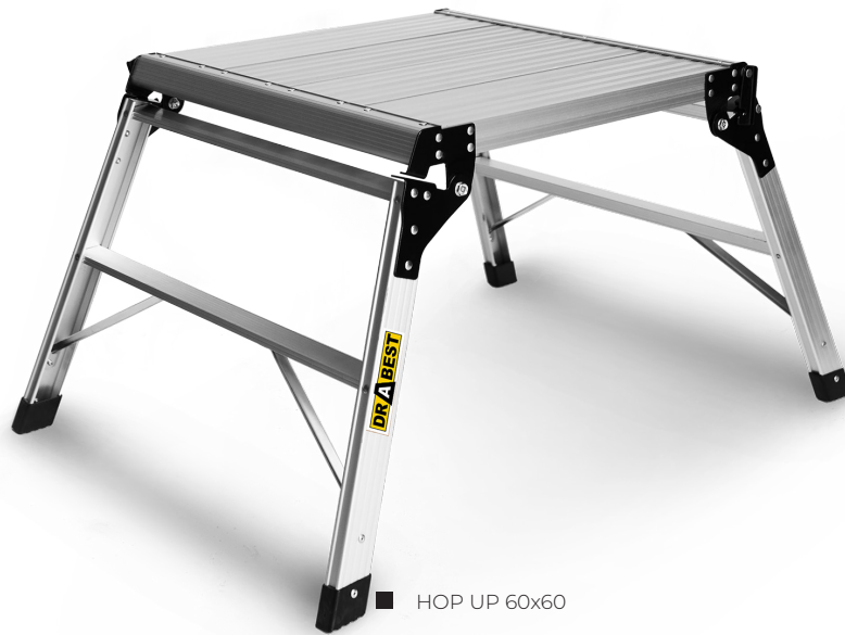
HOP UP 60x60