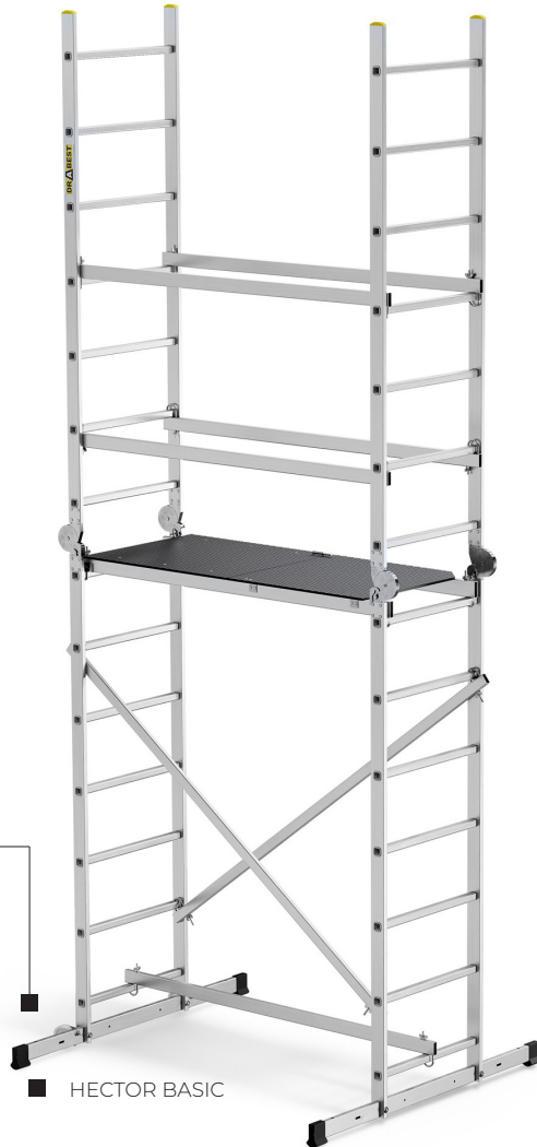
■ HECTOR BASIC