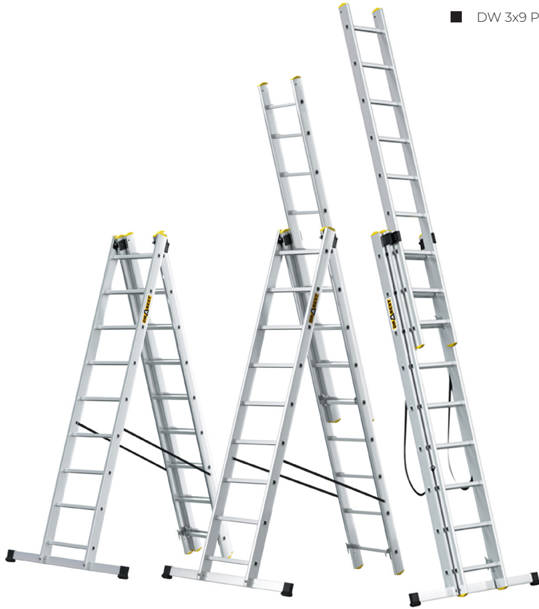
■ DW 3x9 PRO 150 KG