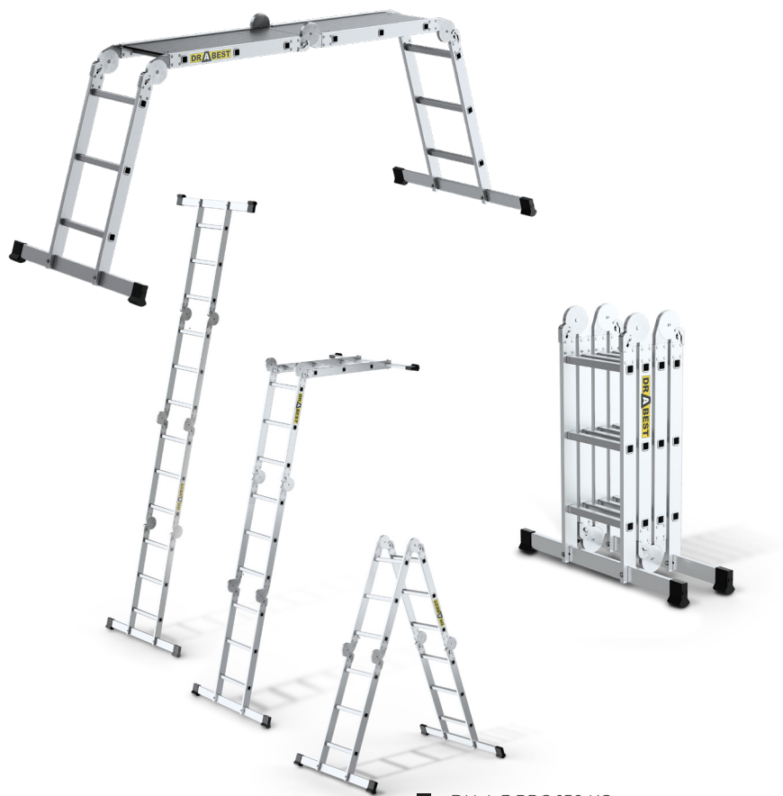
■ DU 4x3 PRO 150 KG