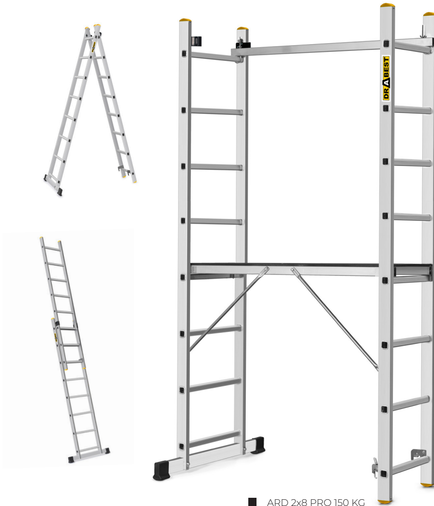
■ ARD 2x8 PRO 150 KG