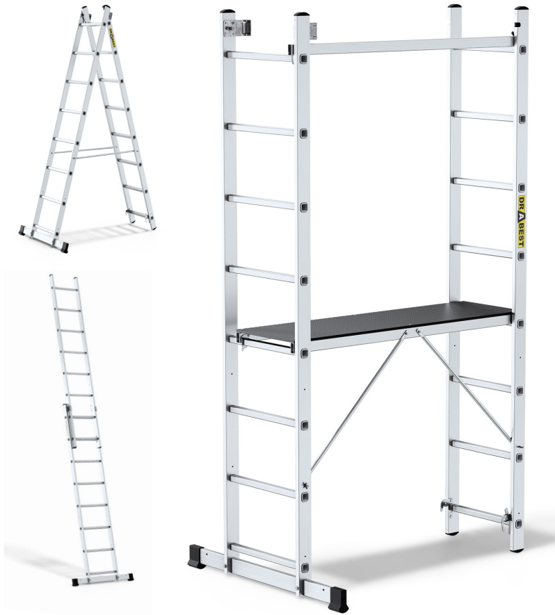
■ ARD 2x8 HOME 125 KG